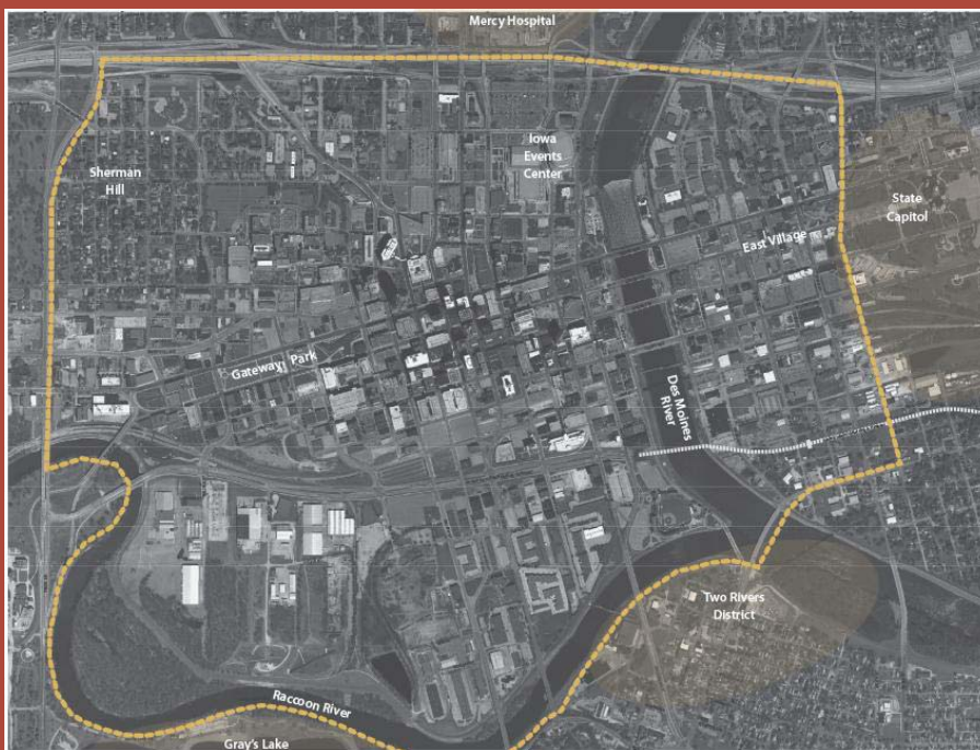
2007 Aerial of Downtown Study Area

Downtown Des Moines has been the recipient of unprecedented investment in the past decade. Nearly $2.8 billion dollars have been spent on a broad range of downtown projects since the turn of the millennium in this metropolitan area with a population of about half million people. Visionary ambitions outlined by several significant planning efforts in the 1980-1990's, including the Des Moines Vision Plan and the Major Projects Task Force findings, inspired a wave of investment in civic, commercial, residential, infrastructure and recreational projects, and spurred a sense of collaboration among the business community, the City of Des Moines, and Polk County. This collaborative spirit, paired with the momentum of recent successes, has produced a shared desire to understand the implications of this recent downtown activity, capitalize on the investments, and plan for new opportunities.